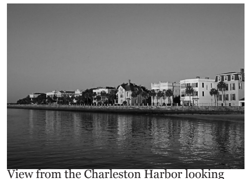
View from the Charleston Harbor looking down the historic homes on Battery Lane.

Centuries have gone by, but the Battery looks as if it has remained untouched. The Gazebo located in the heart of the Battery is the perfect place for weddings. Your dream wedding will be filled with the perfect historic charm of the South Carolina coast.